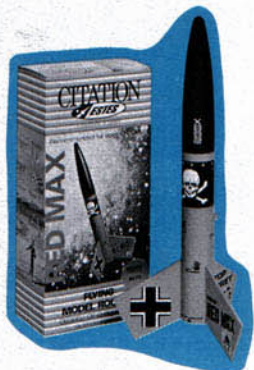
RED MAX KC-2 $2.75