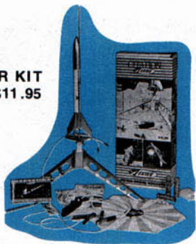
STARTER KIT MKS-1 $11.95