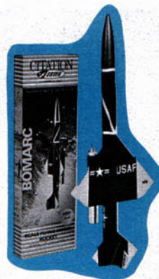
BOMARC KC-5 $5.95