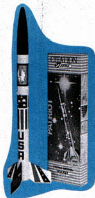
PATRIOT KC-3 $3.75