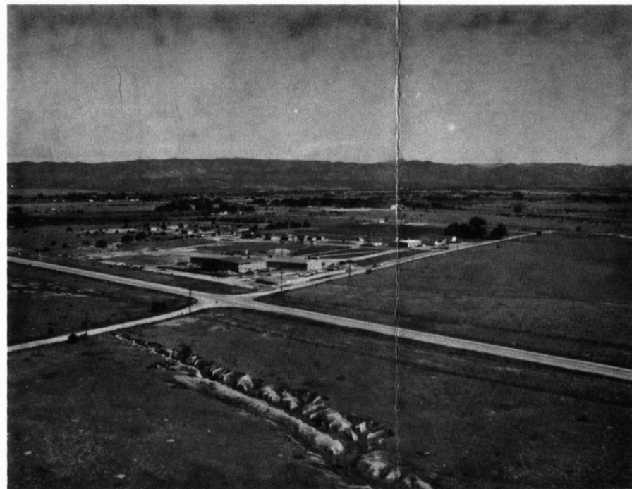
A ROCKET'S EYE VIEW OF ESTES INDUSTRIES