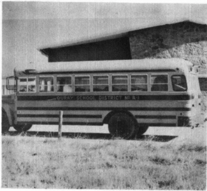
A group of high school students from Ouray, a community located high in the mountains of southwestern Colorado, toured Estes Industries as part of their senior trip.