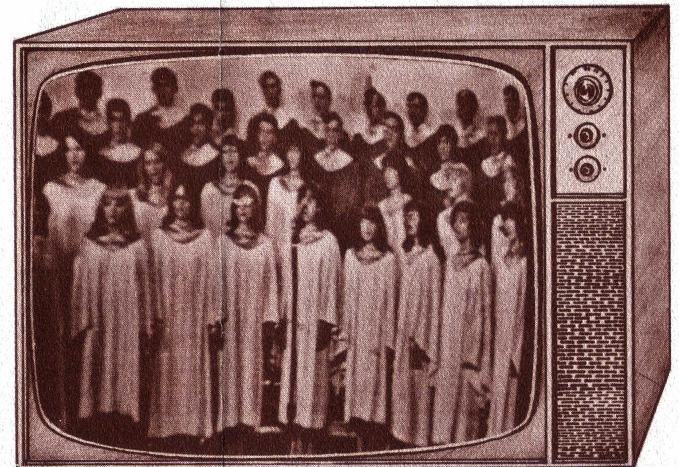
The Florence High school choir as seen at the Estes sponsored TV-II program, December 15.