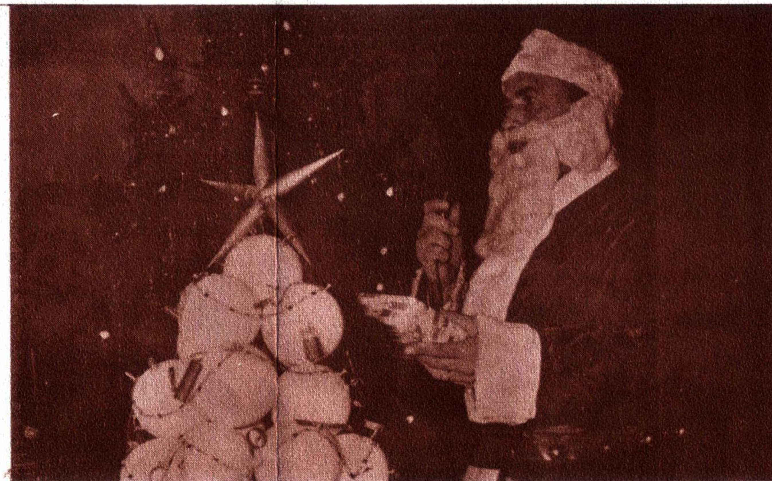
Fun ran the gambit from a Conga line to Bingo- and the gift exchange. Don't know how many there, I was having too good a time to count.