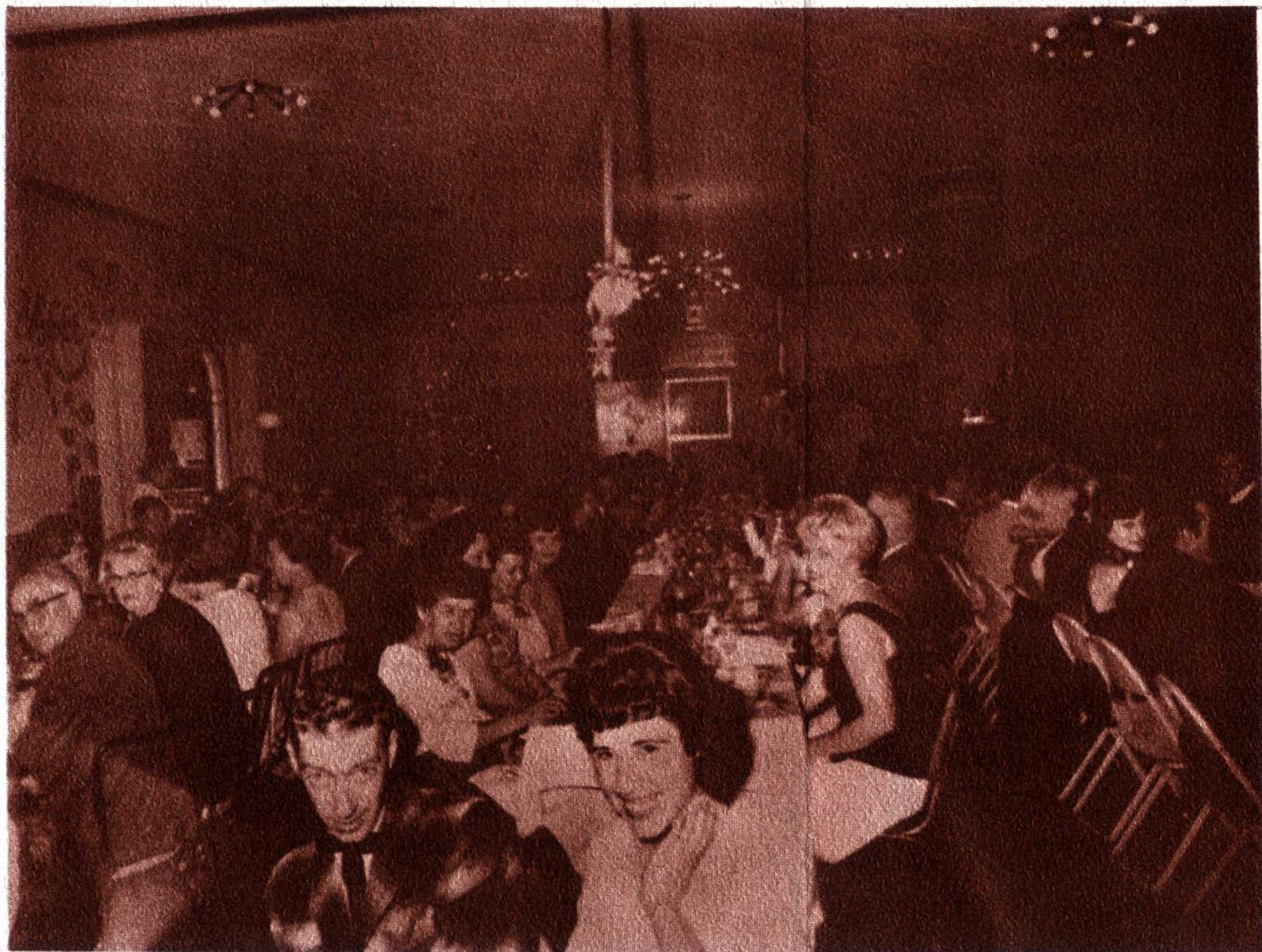
The annual Christmas party was held Saturday, December 17, at the Club Paradise.